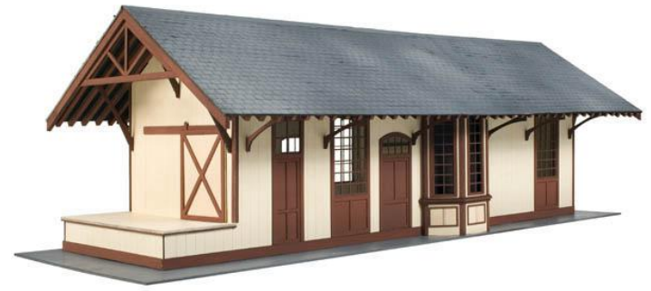
The Atlas Model Railroad Company Maywood Station™ O-Scale Laser-Cut Model Kit

The O-Scale Maywood Station™ Model Kits are available for $125.00 each at Maywood Station on Museum Open House dates and seven-days a week at Maywood Hardware, 39 West Pleasant Avenue, Maywood NJ. The Kits are also available by mail order through our website at <a href="https://www.maywoodstation.com">www.maywoodstation.com</a>. All proceeds go to further preservation and maintenance of the historic Maywood Station Museum.