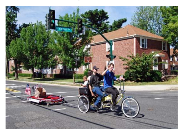
The two-man tricycle and float, one of the two MSHC entries in Maywood's Annual 4<sup>th</sup> of July Parade makes the turn along the parade route off of Maywood Avenue and onto West Pleasant Avenue on July, 3, 2010.