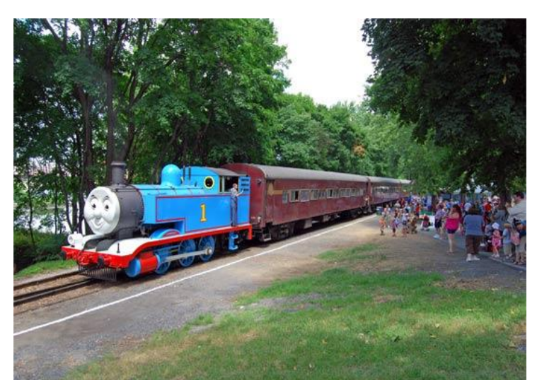
In July of each of the past two years, the NYS&WT&HS have hosted "A Day Out With Thomas" events at the Phillipsburg, NJ train ride operations location. The Thomas locomotive is brought in for the events each year and is actually an 0-6-0 operating steam locomotive.