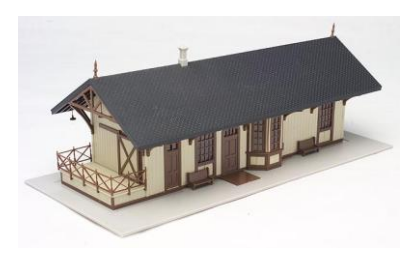
Among the items available in the Maywood Station Museum Store are the award-winning DVD Documentary, The Maywood Station Story , and HO, N and O-scale models of the actual Maywood Station™.