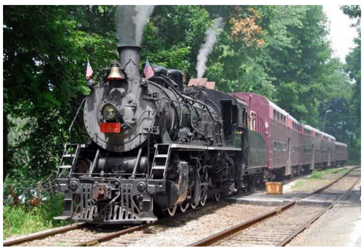
NYS&W #142, a 2-8-2 "Mikado-Type" steam locomotive, powers the NYS&WT&HS's "Mine Train" train ride at Phillipsburg, NJ on July 9. 2010.